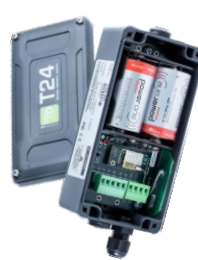
T24-AR Wireless range extender repeater module