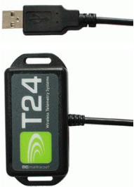
T24-BSu Wireless USB connected base station