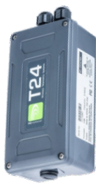
T24-SO Wireless serial ASCII output module