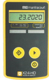
X24-HD ATEX Wireless display for connection to up to 24 load cells