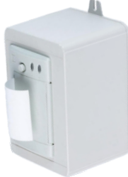
T24-PR1 Wireless surface mounting tally roll printer