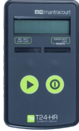
T24-HR Wireless display for connecting to multiple load cells