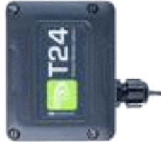
T24-BSue Wireless USB extended range base station