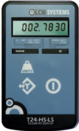
T24-HS-LS Simple wireless display for connecting to 1 load cell