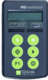
T24-HA Wireless display for connection to up to 12 load cells